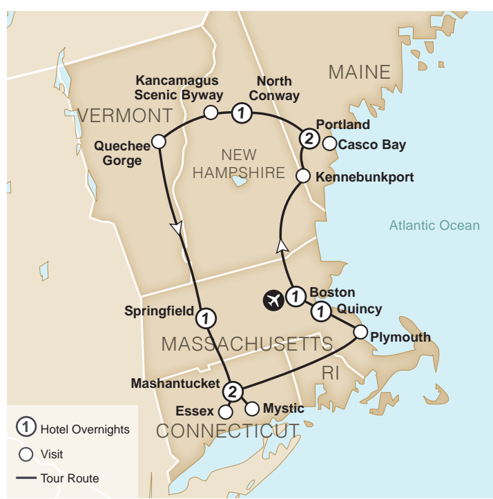
DAY 8: September 30th or October 6, 2023: Plymouth Rock and Whale Watching Cruise: Today pass through the state of Rhode Island, famous for its maritime history. In Plymouth, Massachusetts climb aboard your sea going vessel for a whale watching excursion. This naturalist guide-led cruise sails out to Cape Cod Bay and Stellwagen Bank, a marine sanctuary and primary feeding ground for Humpback, Finback, Minke and the endangered Right Whales. Pay a visit to Plymouth Rock where our forefathers first settled on American soil. Tonight, gather for a farewell dinner hosted by your Tour Manager. Meals: B, D DAY 9: October 1st or October 7, 2023: Travel Home: This morning, take the group transfer to Boston's Logan Airport for flights out after 12:00 p.m. Meal: B