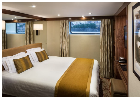
Category E - Window $4,799.00