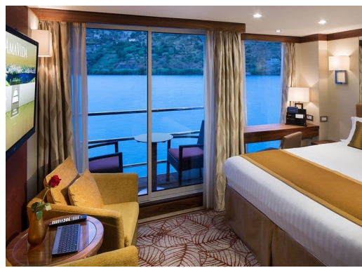
Category B - Balcony $5,899.00