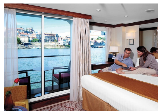
Category A - Balcony $6,199.00

*Rates are per person based on double occupancy.