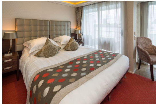
Category BB - Balcony