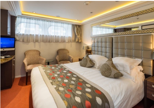
Category E - Window