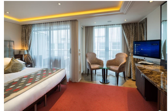
Category AB - Balcony