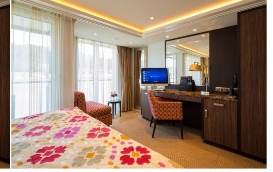
Category AB - Balcony $5,999.00 Category AA - Balcony $6,199.00

*Rates are per person based on double occupancy.