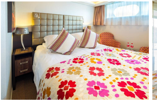
Category E - Window $4,699.00