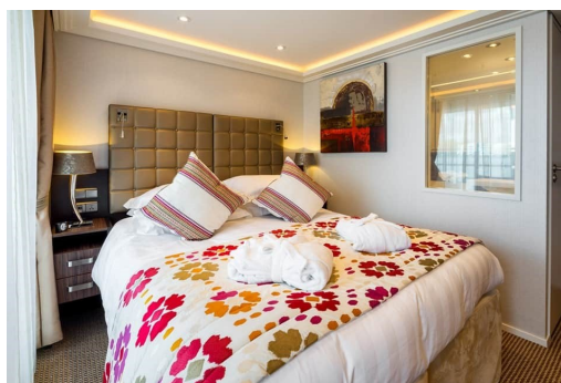
Category BB - Balcony