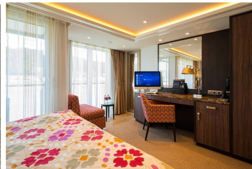
Category AB - Balcony