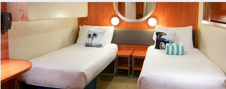
Inside Stateroom $3,999.00 per person