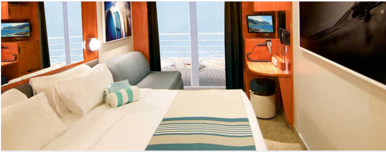
Balcony Stateroom $4,699.00 per person