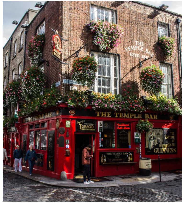
13 Days • 17 Meals: 11 Breakfasts, 6 Dinners

HIGHLIGHTS... Dublin, Irish Evening, Choice on Tour: Dublin City Bus or Walking Tour, Kilkenny, Waterford, Choice on Tour: Waterford Crystal Factory or Waterford Medieval Museum and Wine Vault, Blarney Castle, Boat Tour, Ring of Kerry, Cliffs of Moher, Farm Visit, Galway, Donegal Town, Derry, Giant's Causeway, Glens of Antrim, Belfast, "Titanic Experience"