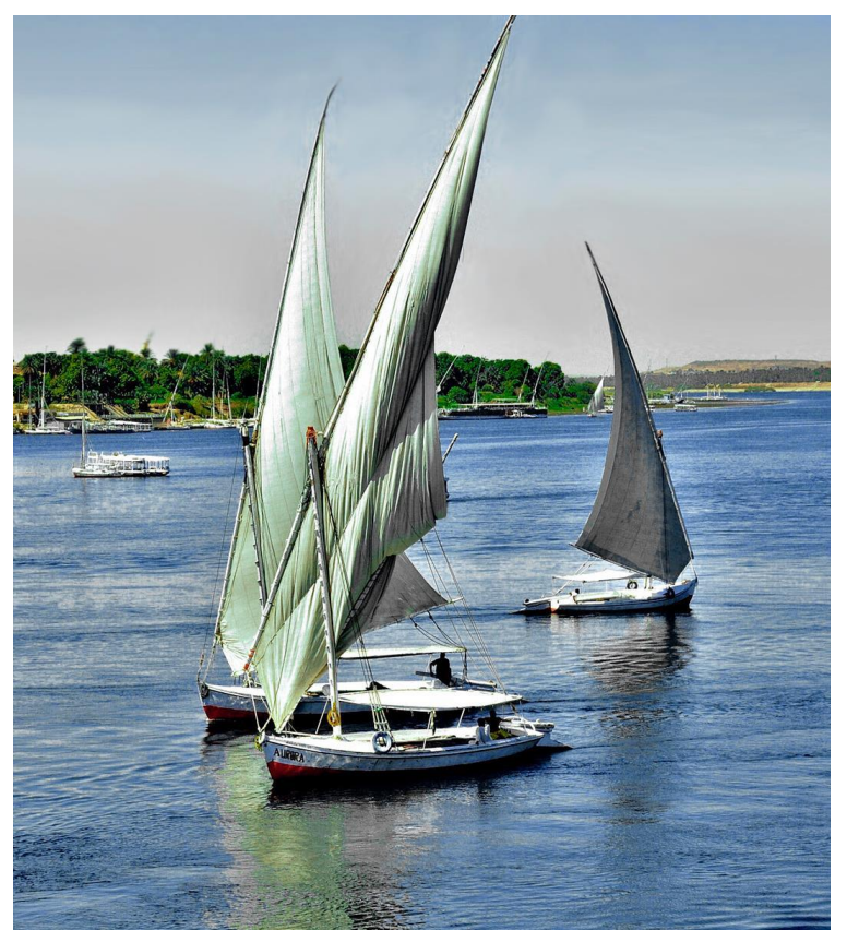
13 Days • 22 Meals: 11 Breakfasts, 4 Lunches, 7 Dinners

HIGHLIGHTS... Giza, Pyramids, Sphinx, Memphis, Sakkara, Museum of Egyptian Antiquities, Luxor, Valley of the Kings, Deluxe 4-Night Nile River Cruise, Temples of Karnak, Kom Ombo, Aswan, Old Cairo