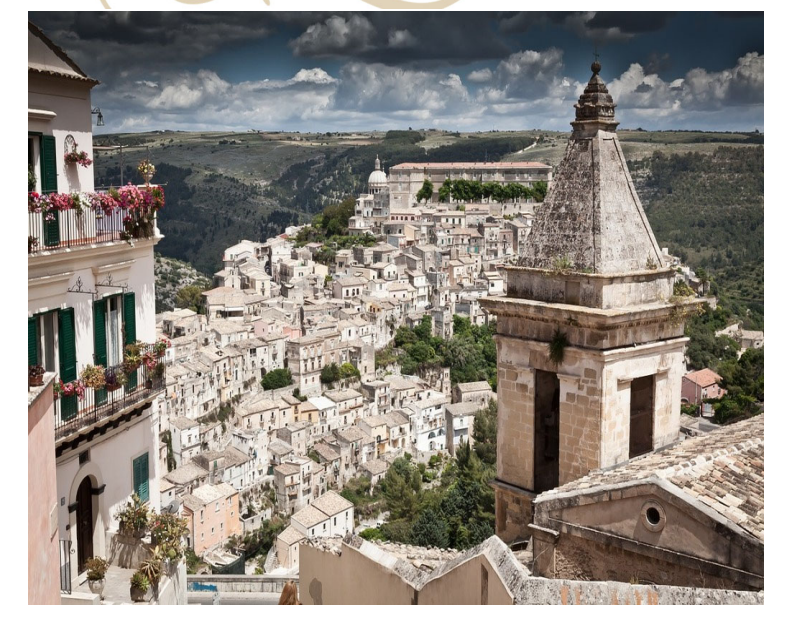
DAY 7: WEDNESDAY, OCTOBER 23, 2019 MESSINA (SICILY), ITALY 8 AM - 6 PM

Visit beautiful Taormina and marvel at its famous Greek theater and the stunning view of Mount Etna. Explore lovely medieval Messina with its historic churches and the cathedral where it is rumored Richard the Lionheart worshipped in 1190. Or discover ancient Tyndaris, founded in 396 B.C. with its fine mosaics, Roman baths and impressive theater overlooking the sea. (B,L,D)