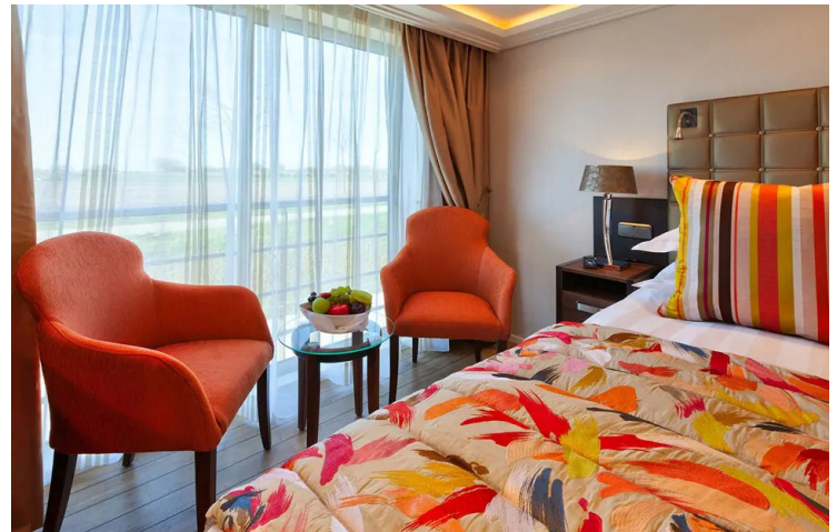
Category C - French Balcony Violin & Cello Deck