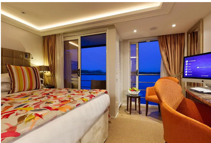
Category BB - French Balcony & Outside Balcony Cello Deck