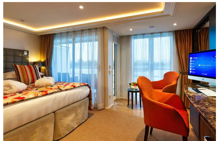
Category AA - French Balcony & Outside Balcony Violin Deck