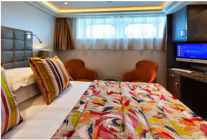
Category D - Window Piano Deck

The difference in cabin categories has to do with features such as windows, type of balcony and location on the ship. All staterooms have Egyptian linen, down pillows and duvet, spacious bathrooms, full-length mirror, hair dryer, safe and direct-dial telephone, flat-screen TV that also works as a computer, Entertainment on Demand system providing complimentary TV, movies and music library, Complimentary internet and Wi-Fi. All rates are per person based on double occupancy. Rates for single cabins and suites are very limited rates are available on request.